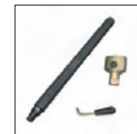
Universal quick change device for tool-heads