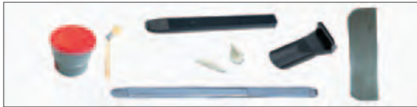
Tire paste, paste brush, bead lever and kit of plastic protectors for alloy rims