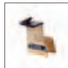
Set of motorcycle wheel adaptors