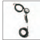
ASTURO tire inflating gun-&gauge (CE norms)