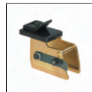
Set of adaptors to increase outside clamping diameter by 4 inches