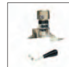
Mount/demount head for convex-spoke rims (VW) complete with polymer inserts to protect alloy rims

For other accessories see separate catalog.