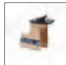
Set of adaptors to reduce outside clamping diameter by 4 inches