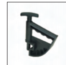
Drop-center mounting clamp