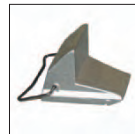
Set of adaptors to reduce outside clamping diameter by 2 inches