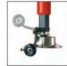
Mechanical bead press roller