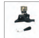
Polymer mount/demount head